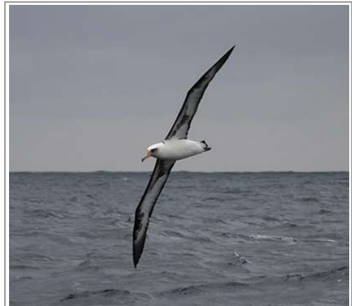
Albatross species such as the Laysan albatross (above) and the black-footed albatross (below) forage in waters offshore, and their ranges overlap with areas being considered for offshore wind energy development.

While the impacts of land-based wind turbines on eagles and other raptors have been well documented, assessing the impact of offshore facilities on seabirds is more challenging.