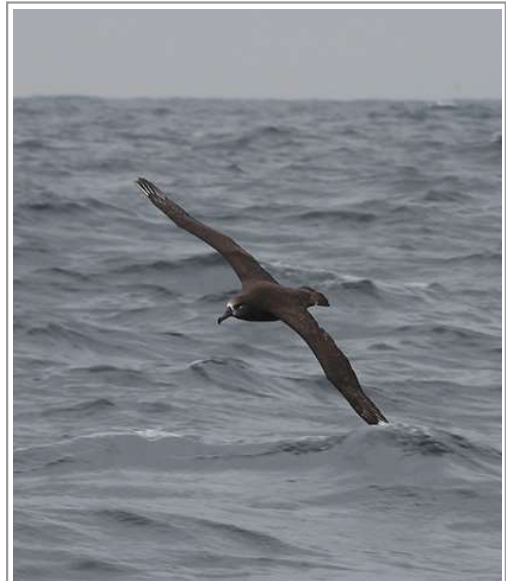
Displacement from foraging sites and direct mortality from collisions with the blades of wind turbines could have detrimental effects on the populations of albatrosses and other vulnerable species.